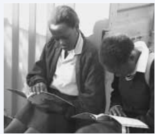
South African students reading Staying Alive, Fighting HIV/AIDS